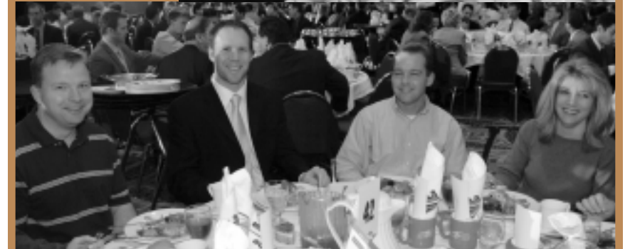
ABOVE: Kirk Maltby, Detroit Red Wings and guests of PricewaterhouseCoopers, March 27, 2007