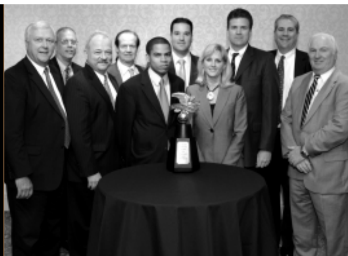
ABOVE: DEC sponsor, Plunkett & Cooney and guests with the 2006 American League Championship Trophy. April 17, 2007

For more information on these meetings, please visit our website at www.econclub.org