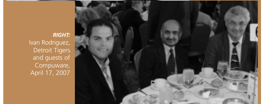
RIGHT: Ivan Rodriguez, Detroit Tigers and guests of Compuware, April 17, 2007